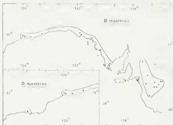
Figure 3 — Map showing distribution of Drysdalia mastersii .

All seven specimens are conspecific with the lectotype.